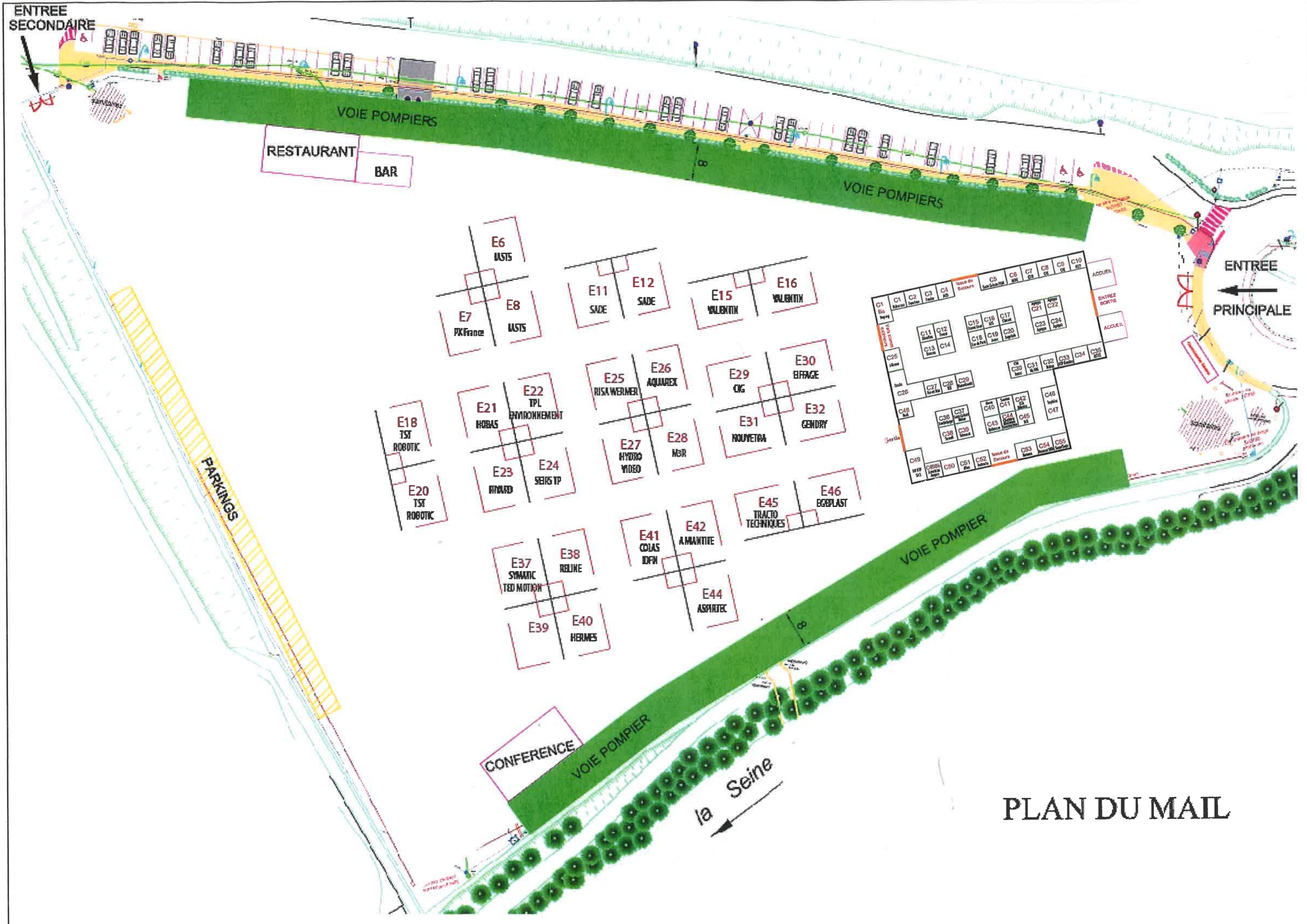
PLAN DU MAIL